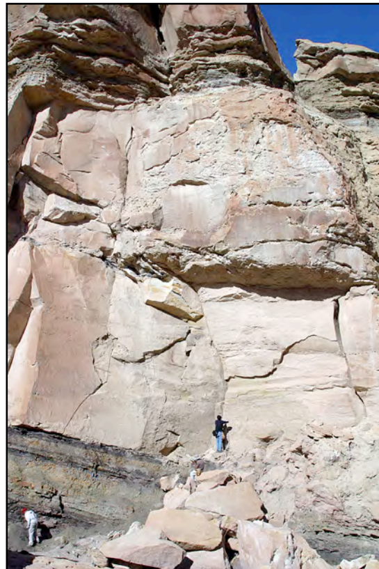
Multi-storey valley fill overlying rooted floodplain, Middle Caineville.