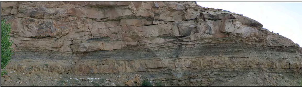
Prodelta to delta front transition, Caineville South.