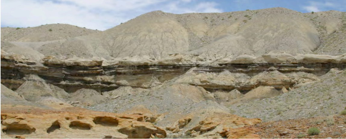
Field photo of river cutbank in highstand fluvial deposits, Ferron Sandstone, Sweetwater Wash, Utah